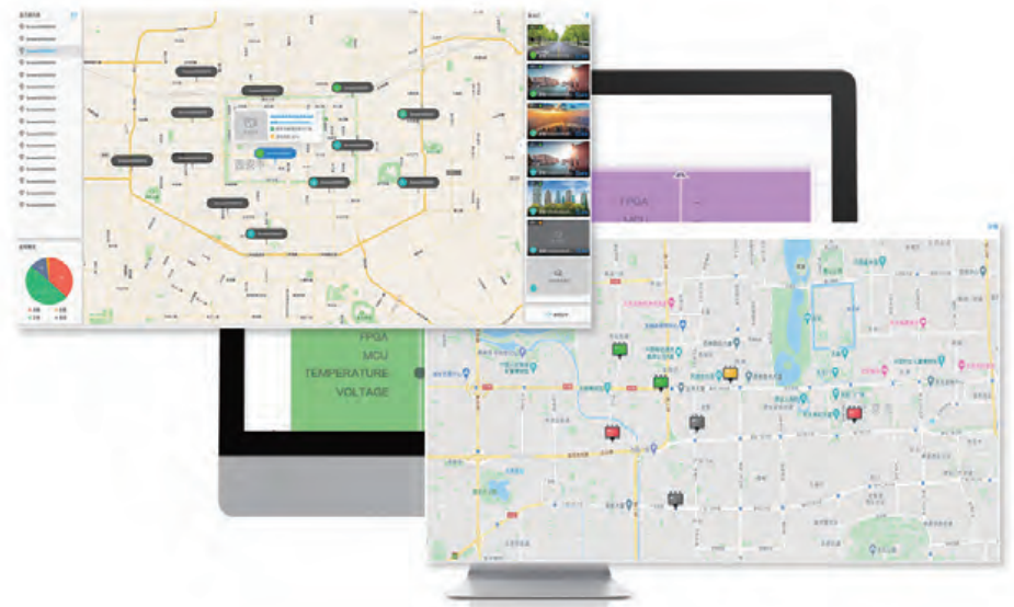
Real Time Monitoring

Lower Power Consumption / Lower Screen temperature / Real-time Monitoring