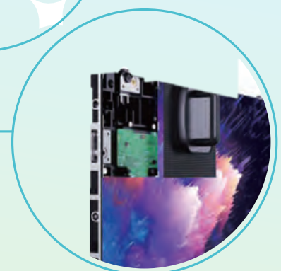
Fully Front Access